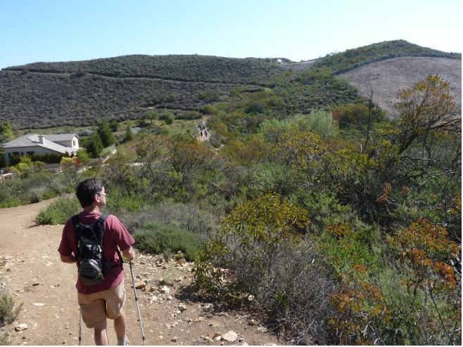
Take only photographs and leave nothing, not even tracks!